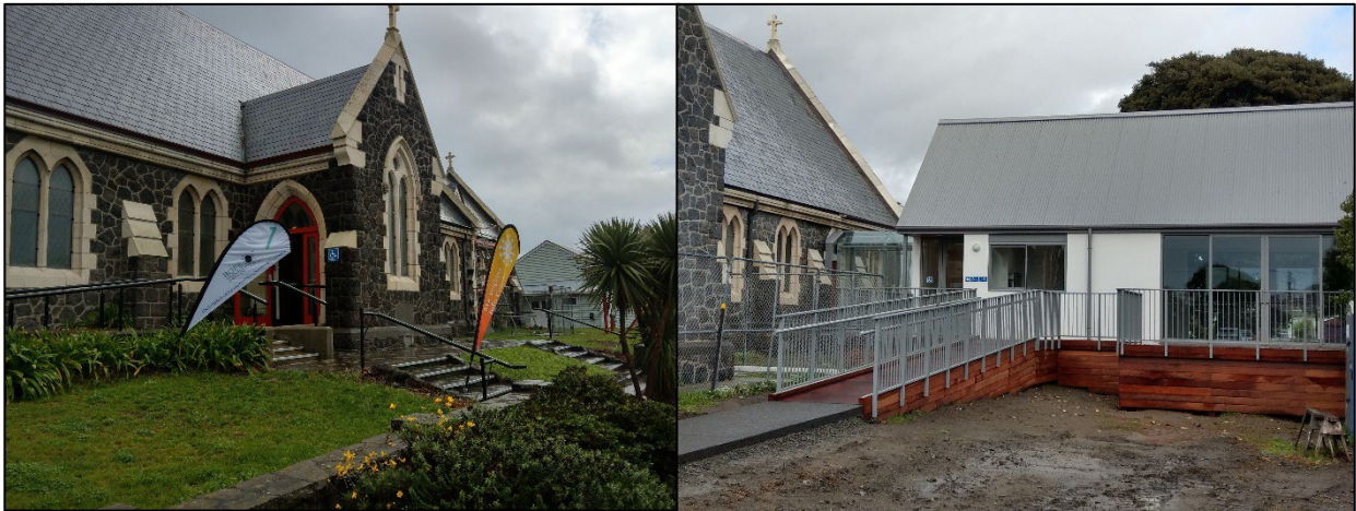
Te Waka Aroha St Faith's showing office entrance and new annex.

Research Currently our work is focused in the areas of waste, adaption and agriculture, (termed 'Wicked Problems'):